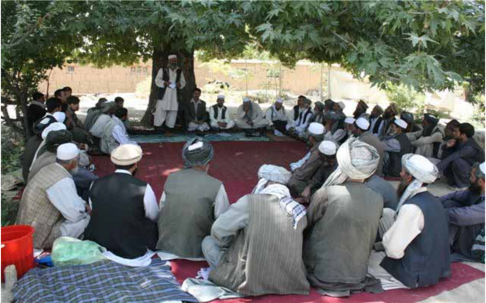
Qarghai District-Laghman Province