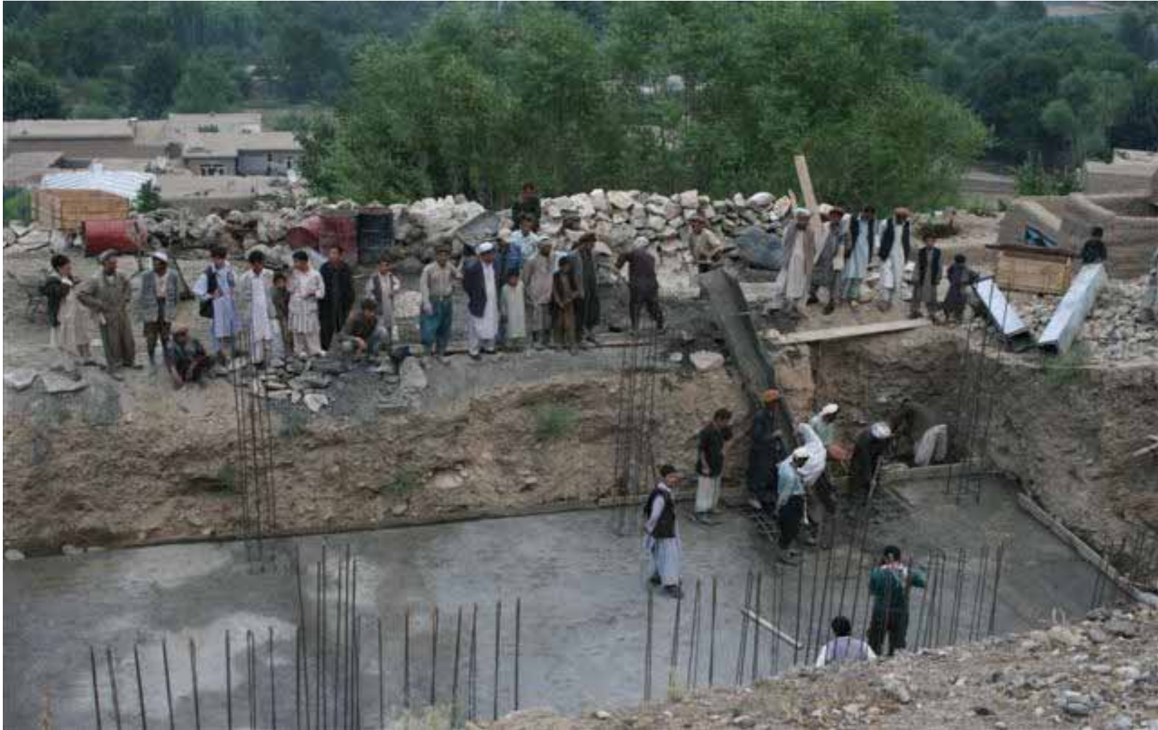
Jurm distric- Badakhshan Province