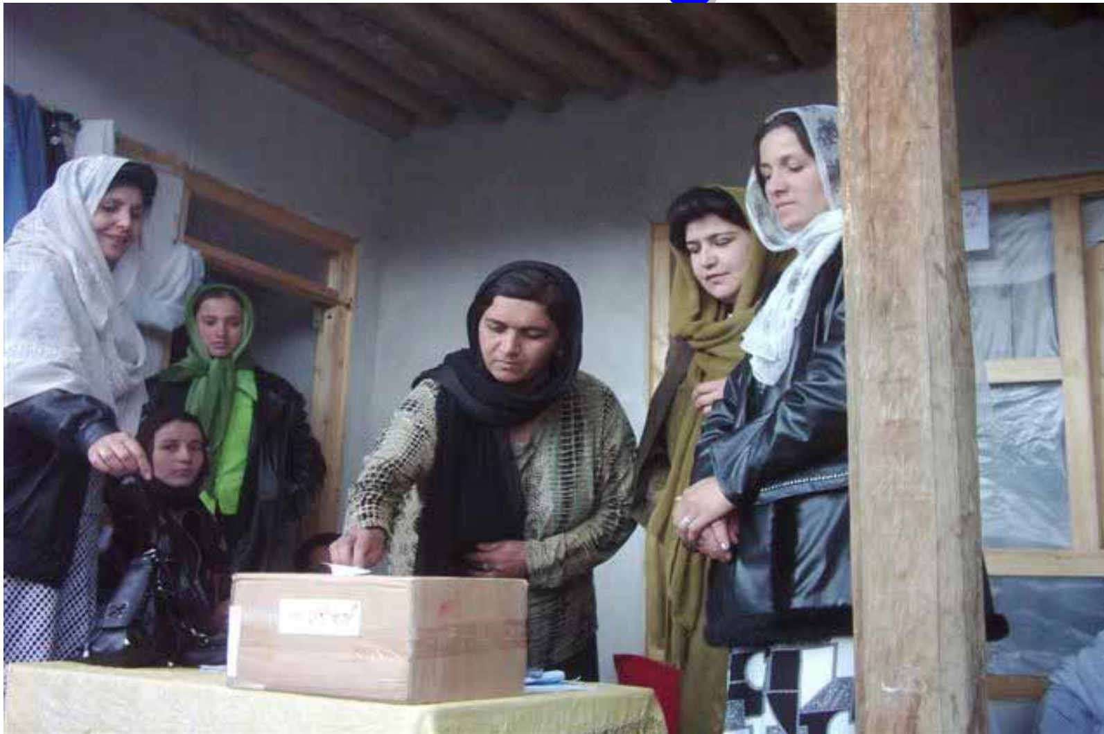
Injil District- Herat Province